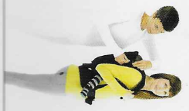
2.9 On each shoulder strap, roll excessive webbing up and secure with elastic band on the end.