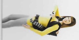
2.6 Adjust size of shoulder straps by pulling upward. Make sure the fit is tight and safe.