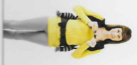
2.7 Close chest strap in front of you and adjust the fit by pulling sideways onto its free end. Chest strap should be at collar bone level.