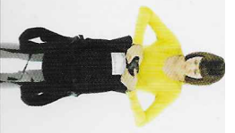
2.1 First open chest strap and waist belt buckles.