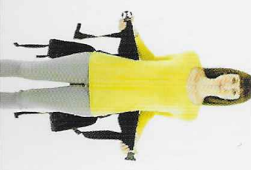
2.2 Place waist belt around your hips. Close waist belt buckle in front of you. Adjust size of waist belt to fit tight. Roll excessive webbing up and secure with elastic band on the end. Fully tighten perfect fit adjusters on top of each shoulder strap.