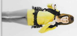
2.8 For better fit, loosen or tighten perfect fit adjusters on top of each shoulder strap. Initially, assistance of another person is helpful too.