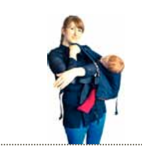
Once you are sure baby is secure, hold the gathered shoulder straps with both hands. Slide your right arm through the fastened right hand shoulder strap.