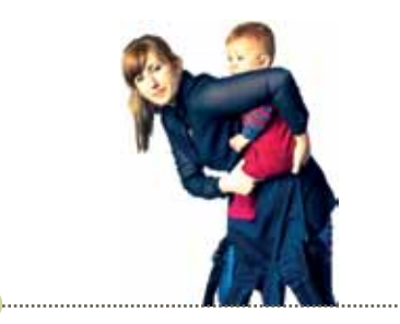
Holding baby with one hand, lean forward and slide baby around your hips towards and onto your back. Use your free hand to help guide baby around your hip and shift their weight onto your back.

Pick up baby and sit them on your hip. When learning this step, do so over a soft surface such as a bed or sofa. For the first few times another person assisting you may be helpful too.