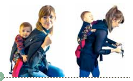
Reach back and hook your arms through the fastened shoulder straps. Carefully pull baby's weight up onto your back. Pull the webbing to tighten the straps. Always ensure the fit is tight and secure.