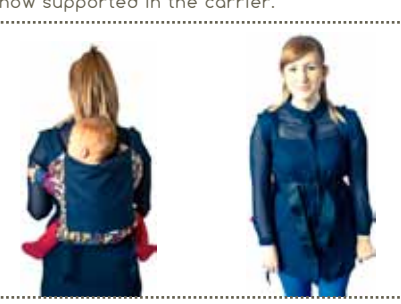
You are ready to go.

With one hand supporting baby at all times, reach with your free hand for one of the fastened shoulder straps. Gather the other fastened shoulder strap so that you have BOTH shoulder straps in your free hand. Baby is now supported in the carrier.