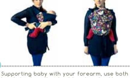
Supporting baby with your forearm, use both hands to close the shoulder strap buckle on the side of the carrier, you will hear an audible click. To tighten the strap pull the webbing backwards. Always ensure the fit is tight and secure. You may wish to use the integral sleep hood for extra head support. You are ready to go.

As before, with one hand supporting baby at all times, reach for the other shoulder strap with your free hand and place it on your shoulder. Switch hands and reach back for the end of the shoulder strap, bringing it across your back. This should now form a cross over your back