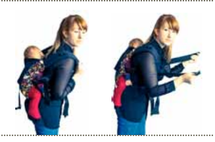
Grasp both shoulder straps with one hand. With your free hand tighten the webbing on one strap. Switch hands and repeat this step on the other strap. Ensure the fit is tight and secure.