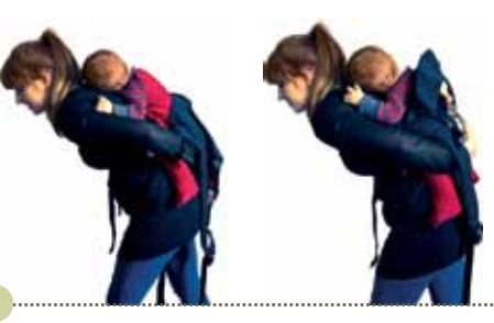
With both hands on baby, gently manoeuvre them up to the centre of your back into a piggy back position