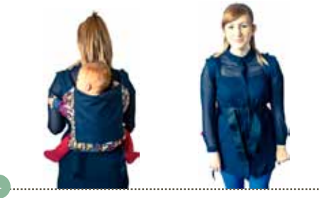
You are then ready to go. To remove baby simply reverse the steps above and lower baby onto a soft surface. If desired, the accessory strap can be fastened around the shoulder straps to help keep them in place.