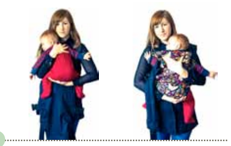
Pick up baby and tuck their legs into your waistline. Bring the panel of the carrier up between baby's legs and over their back.