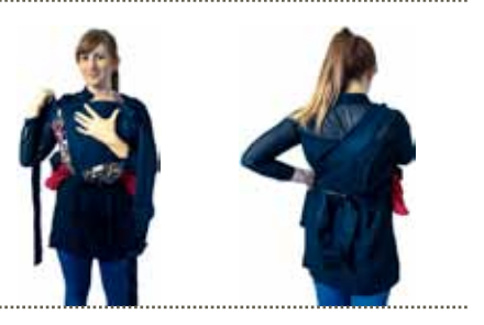
With one hand supporting baby at all times, reach for a shoulder strap with your free hand and place it on your shoulder. Switch hands and reach back for the end of the shoulder strap, bringing it across your back.