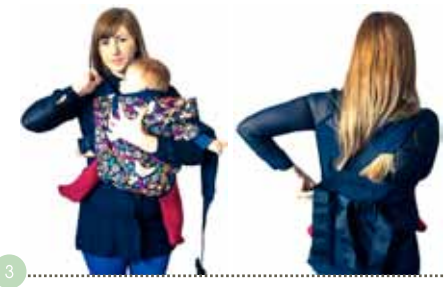
With one hand supporting baby at all times, reach for a shoulder strap with your free hand and place it on your shoulder. Switch hands and reach back for the end of the shoulder strap, bringing it across your back.

As before, with one hand supporting baby at