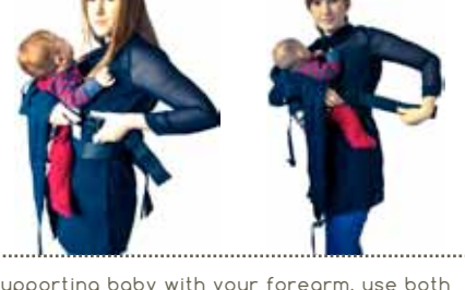
Supporting baby with your forearm, use both hands to close the shoulder strap buckle on the side of the carrier, you will hear an audible click. To tighten the strap pull the