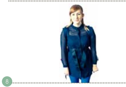
If desired, the accessory strap can be fastened around the shoulder straps to help keep them in place.