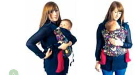
Supporting baby with your forearm, use both hands to close the shoulder strap buckle on the side of the carrier, you will hear an audible click. To tighten the strap pull the webbing backwards. Always ensure the fit is tight and secure. You may wish to use the integral sleep hood for extra head support. You are ready to go.