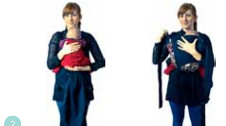
Pick up baby and tuck their legs into your waistline. Bring the panel of the carrier up between baby's legs and over their back.

Fasten the carrier around your waist like an apron with the outside against your legs. Fasten the accessory strap around the seat of the carrier and tighten to narrow the seat. The width should be sufficient to support baby in a seated position with knees level with or higher than their bottom. Slide the accessory strap buckle to the outside of the carrier.