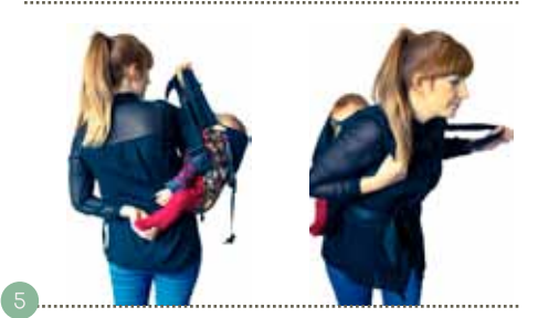
Check baby is still secure. Use your right hand to grasp both shoulder straps and your left to slide the waistband round so that baby is now in the centre of your back. Lean forward slightly and slide your left arm into the fastened left hand shoulder strap.