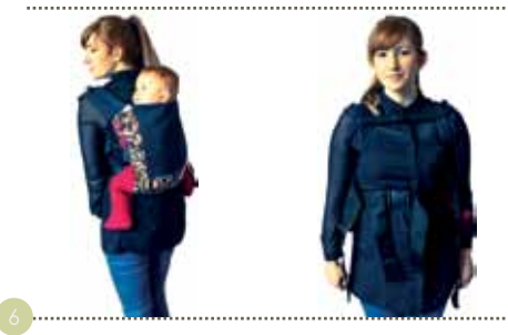
You are ready to go. To remove baby, reverse the above steps. If desired, the accessory strap can be fastened around the shoulder straps to help keep them in place.