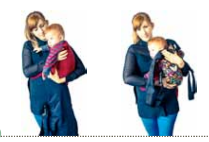
Pick up baby and sit them around your waist on top of the carrier with their legs either side of you. Bring the panel of the carrier up between baby's legs and over their back.