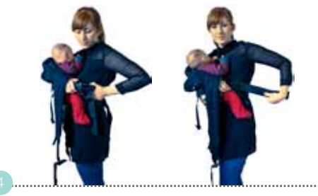
Supporting baby with your forearm, use both hands to close the shoulder strap buckle on the side of the carrier, you will hear an audible click. To tighten the strap pull the webbing backwards.